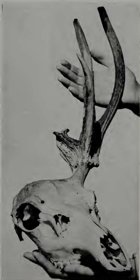
Fig. 5. Skull of red deer stag Lejek

The parietal graft and the left, operated antler were cast between the 3 and 4th April, 1962. The parietal graft was cast a little earlier, than the left operated antler. The right, operated antler was cast between April 4 and 5th, 1962. The frontal graft was torn off by hand on April 5, 1962, it held very lightly. This manipulation was performed to avoid the search for this small antler after casting. The parietal graft was not found. The weight of the remaining antlers was as follows (g): left, operated — 270, right, operated — 490, frontal graft — 1.32.